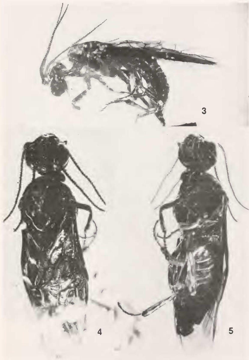
Figs. 3-5. 3, Didymia protera (H-10-48-B). 4, D. poinari (H-10-48-C) dorsal view. 5, D. poinari (H-10-48-C), ventrolateral view.